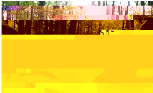
The North Woods