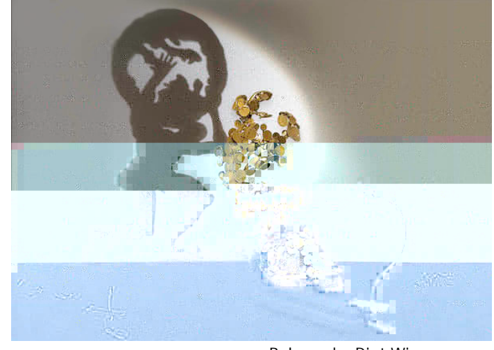
At las of Balance by Diet Wiegman